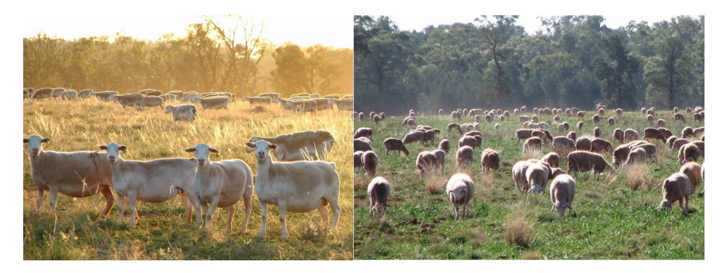
Managing Native Grasslands for Soil and Animal Health

Holbrook Town Hall, Holbrook, NSW, Australia 9<sup>th</sup> and 10<sup>th</sup> November 2011